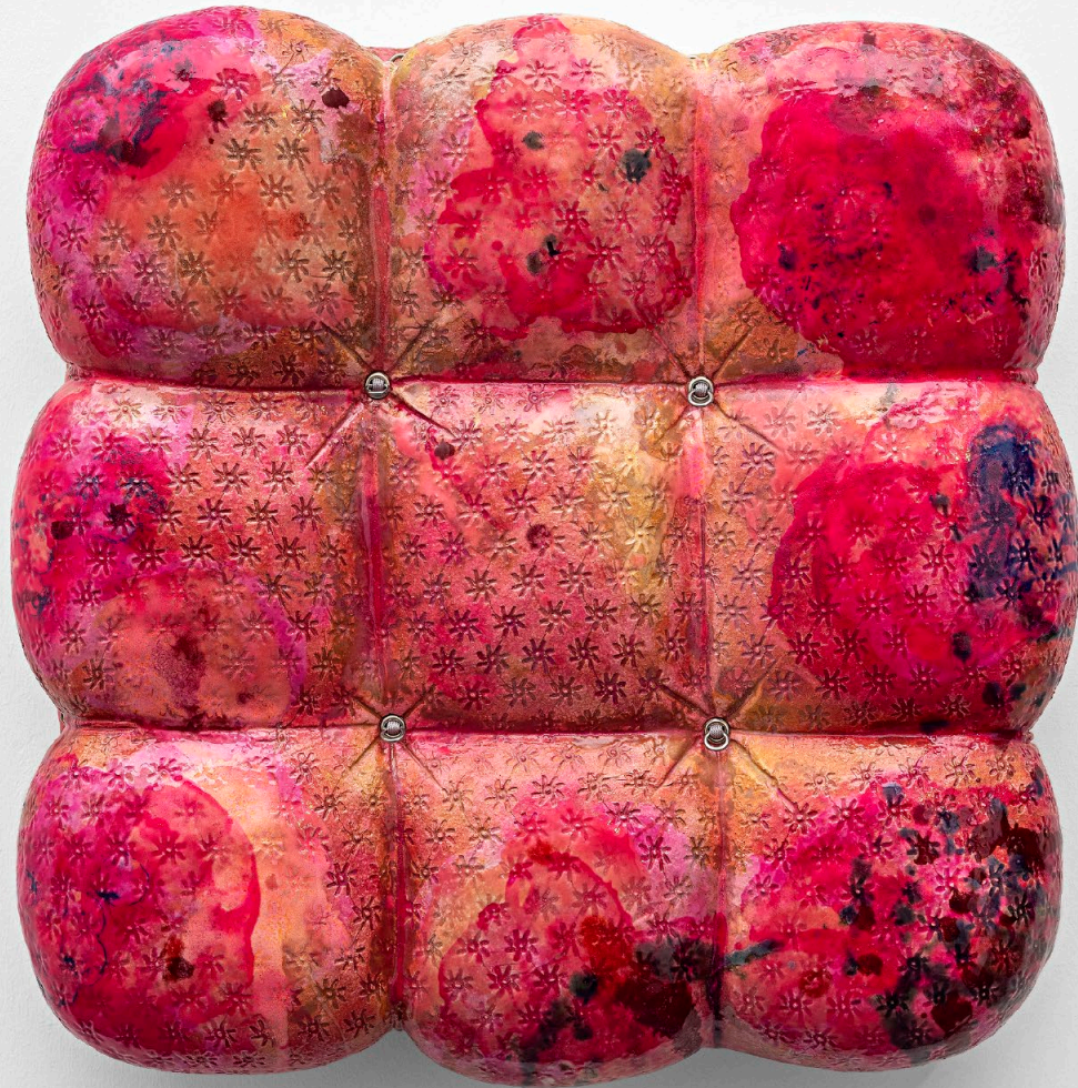
Eirik Sæther CAMALEONDA # 1, 2023 Glazed stoneware ceramics, stainless steel and nylon thread 53 x 53 x 14 cm Unique piece CTES.001.2023